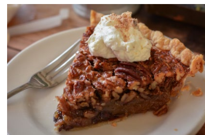
The Tavern in Old Salem pecan pie

680 West 4th St., Winston-Salem, NC 336-893-6144