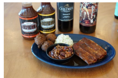
Bibs Downtown BBQ plate

770 Liberty View Ct. Winston-Salem, NC 336-306-9023